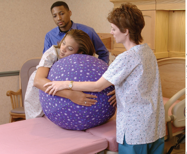
Figure 2. Side-Lying in Fetal Position to Facilitate "C Curve."

Figure 1. Standing With Labor Ball to Promote "C-Curve" Position.