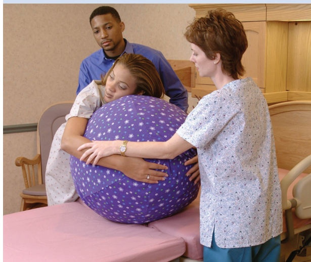
Figure 1. Standing With Labor Ball to Promote "C-Curve" Position.