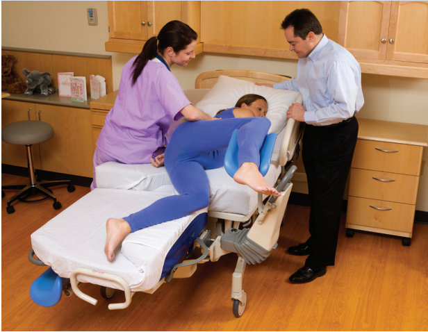
Figure 7. Using a Side-Lying Lunge Position to Rotate an OP Presentation.