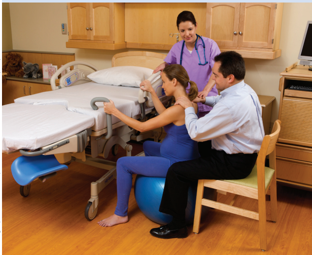
Figure 5. Sitting Upright on Birthing Ball With Support of Labor Partner.