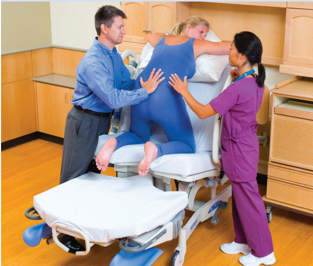
Figure 9. Kneeling Over Back of Bed to Facilitate OP Rotation.