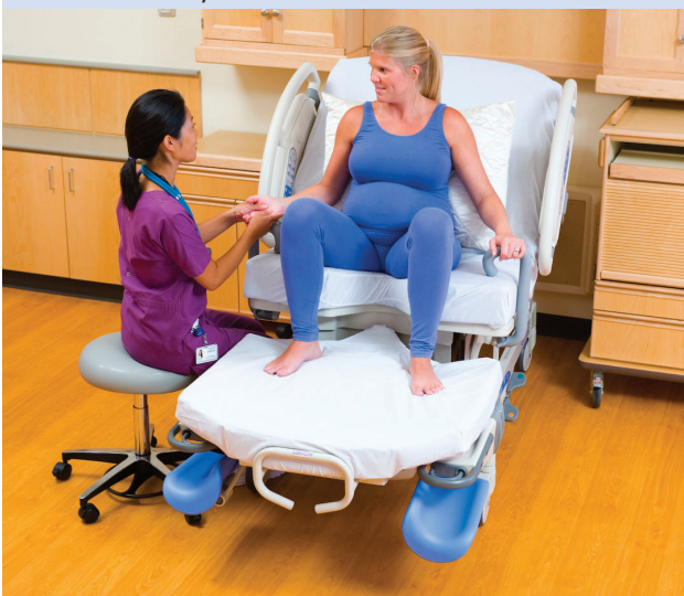
Figure 6. Sitting Upright in “Throne” Position to Increase Gravity and Pelvic Outlet Diameters.